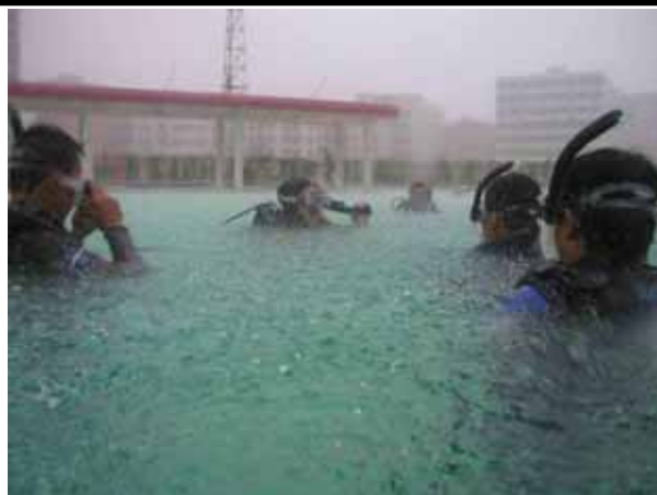
Fig. 1 The third Country-wide Underwater Archaeology Specialists Training Course