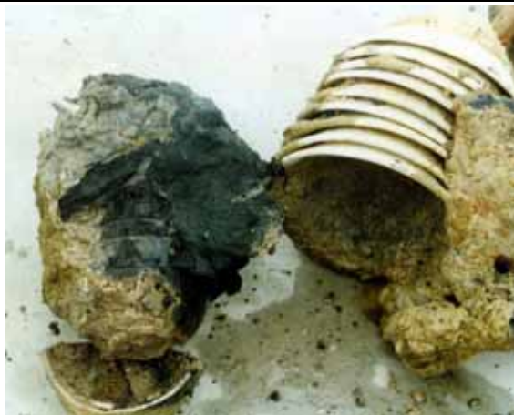
Fig. 17 Block