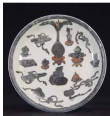
Fig. 15 Wucai Porcelains from Wanjiào I Qing Dynasty shipwreck