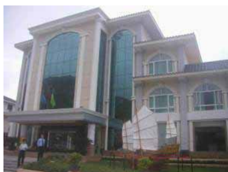
Fig. 12 Underwater Archaeology Research and Training Base