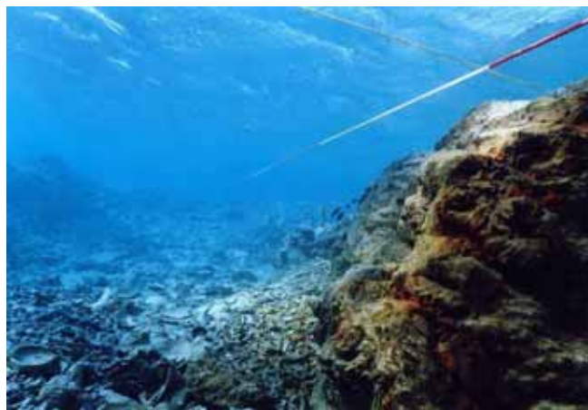
Fig.18 Surface of the wrecksite bombed by fishermen, Huangguang Reef in Xisha.