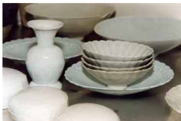
Fig. 4,5 Porcelains were unearthed from The Nanhai I Shipwreck of South Song Dynasty in Guangdong