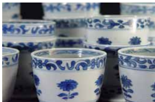
Fig. 11-A Blue and white porcelains were unearthed from Wanjiao I Shipwreck