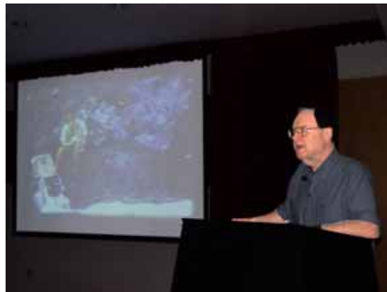
Fig. 13 “Father of underwater archaeology” Geoge. Base in base, May 2004.