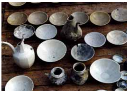
Pic.6,7 Excavation in Xisha Islands and Relics