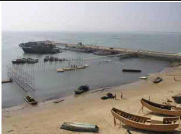
Fig. 14 Donggu Wardhip Site