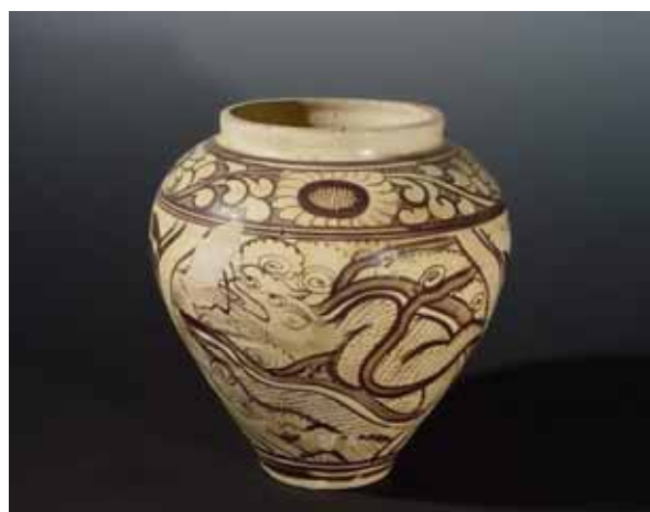
Fig.2, 3 Porcelains were unearthed from Shipwreck of Yuan Dynasty in Suizhong, Liaoning Province-Playing child jar, Dragon and phoenix jar