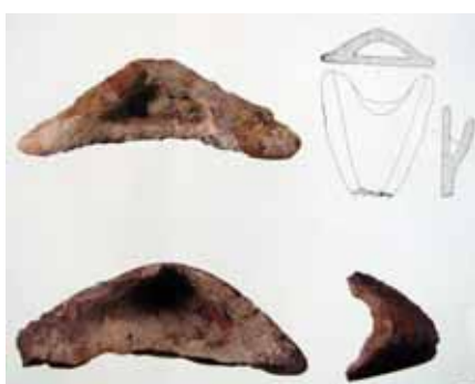
Fig. 16 Iron ware from Sandaogang Yuan Dynasty shipwreck