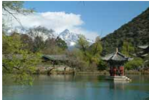
Figure2 Dongba character of Yulongxueshan and the view from Heilongtan