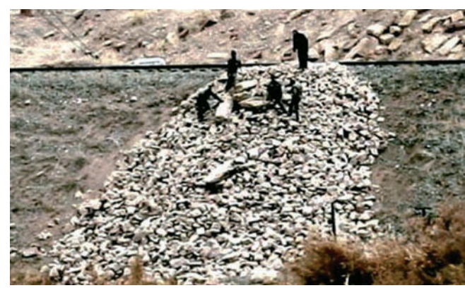
An Azerbaijani "military base" and "firing range" stationed at the site of the annihilated cemetery (Photo: Arthur. Gevorgian, March 2006)