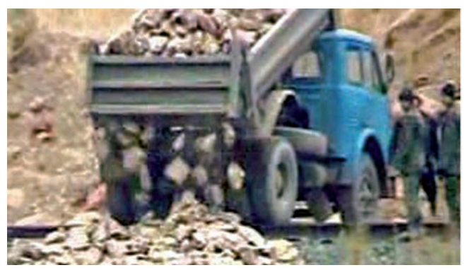
The crushed pieces of khatchkars emptied into the Araxes-facing side of the railway (Photos: Arthur Gevorgian, December 10-14, 2005)