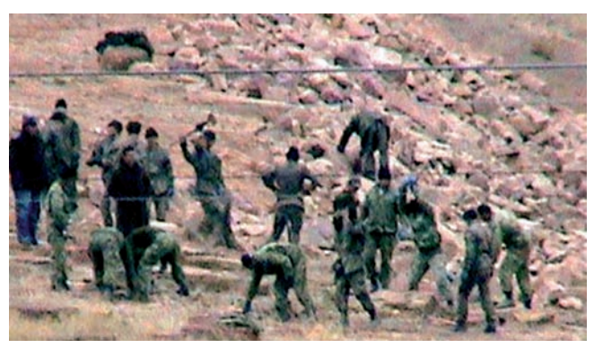
Azeri soldiers breaking the khatchkars to pieces with heavy hammers (December 10-14, 2005)