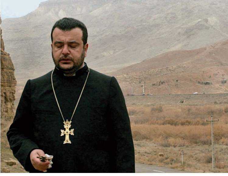
"Requiem" for Armenian cultural monuments

A comprehensive documentation was submitted to UNESCO in October 2006 by an international parliamentary delegation: Parliamentary Group Switzerland-Armenia (ed.) , "The Destruction of Jugha and the Entire Armenian Cultural Heritage in Nakhijevan". (Copies can be ordered from SAA Switzerland-Armenia Association ,