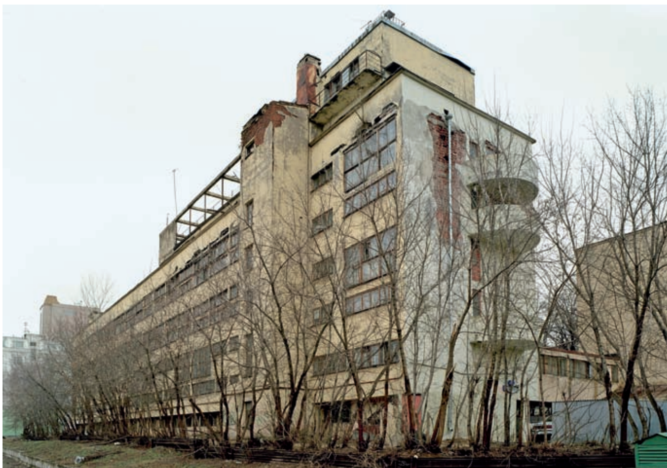
Narkomfin Commune House, Moscow, 1928–30, arch. M. Ginzburg, I. Milinis, View from south-west in 2005