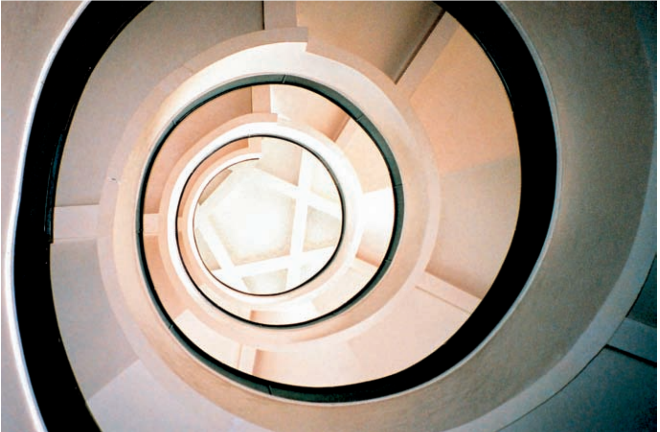
The spiral staircase of the Dzerzhinsky Club. Current condition.