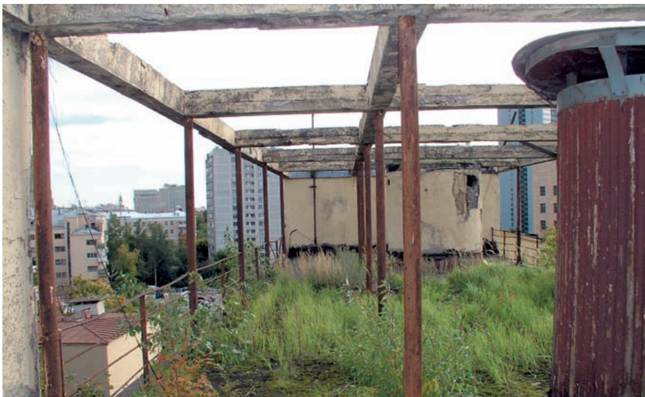
Narkomfin Commune House, Moscow, 1928–30, arch. M. Ginzburg, I. Milinis. Roof in 2005.