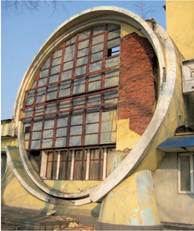
Gosplan Garage of the State Planning Committee, Moscow, 1933–36, arch. K. S. Melnikov, V.I. Kurochkin, monument of local importance. Condition in 2005.