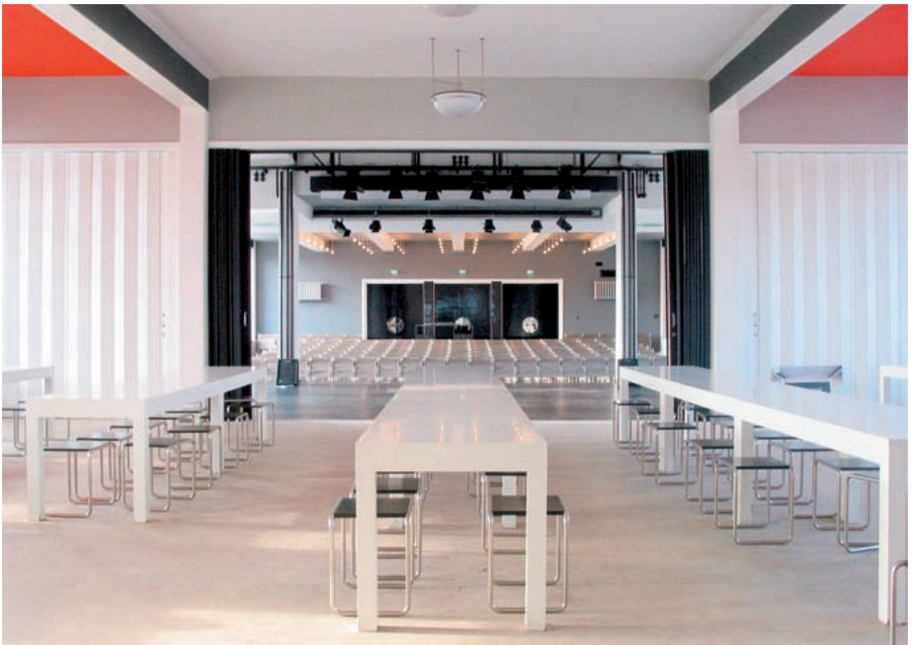
Bauhaus Building in Dessau, arch. W. Gropius, 1925. Interior of the canteen after the restoration. Current condition.