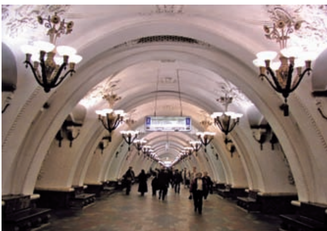
↘ (right) Mayakovskaya metrostation, Moscow, 1938, arch. A. Dushkin, artist A. Deineka. 2006.