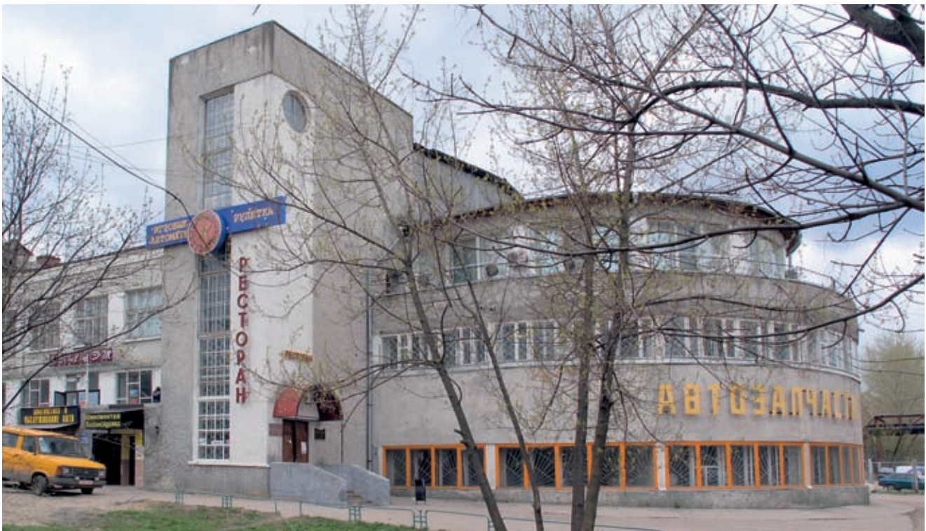
Metal workers club in Kashira near Moscow. 1929–30, arch. unknown. Current condition.