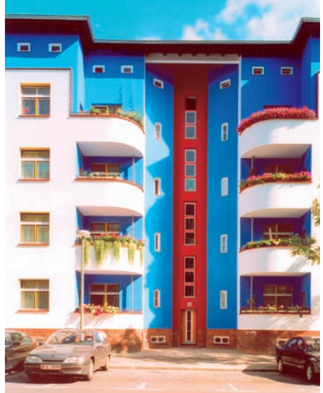
Housing block in Berlin-Pankow, Heinz-Bartsch-Straße 4, 1926–27, arch. B. Taut. Before and after restoration (1997 and 1998). Credit: Winfried Brenne Architekten, Berlin

MONO school (MONO = Moscow department for education), Moscow, 1929, arch. L. Fedorov, M. Motylov. The important prototype for schoolbuildings of the 1930s in Moscow was completely destroyed during reconstruction works in 2006. Credit: A. Zalivako, Berlin