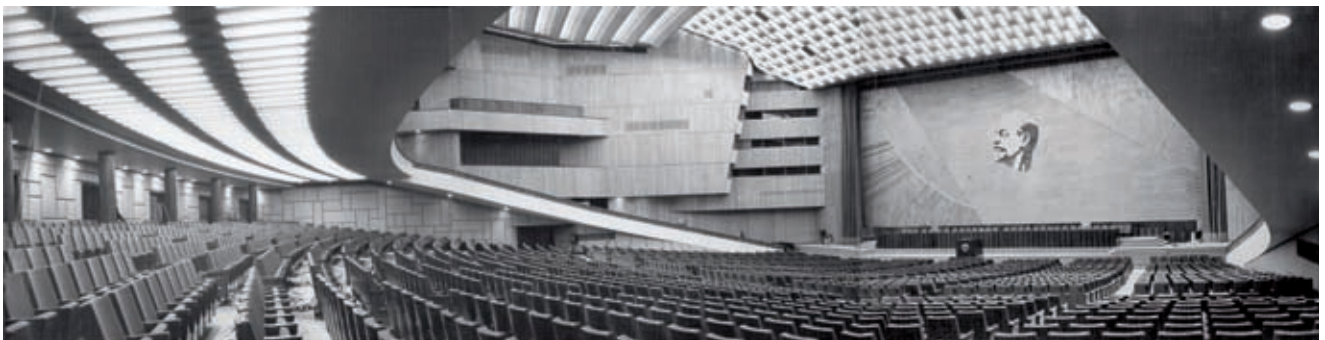
Palace of Congresses, Moscow Kremlin, 1961, arch. M. Posokhin, A. Mndoyants et al. View of the auditorium in 1961 and 2004.