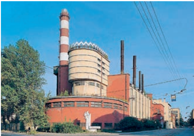
Powerstation of the "Krasnoje znamja" Textile Factory in St. Petersburg, 1926–1928, arch. E. Mendelsohn. Condition in 2005.