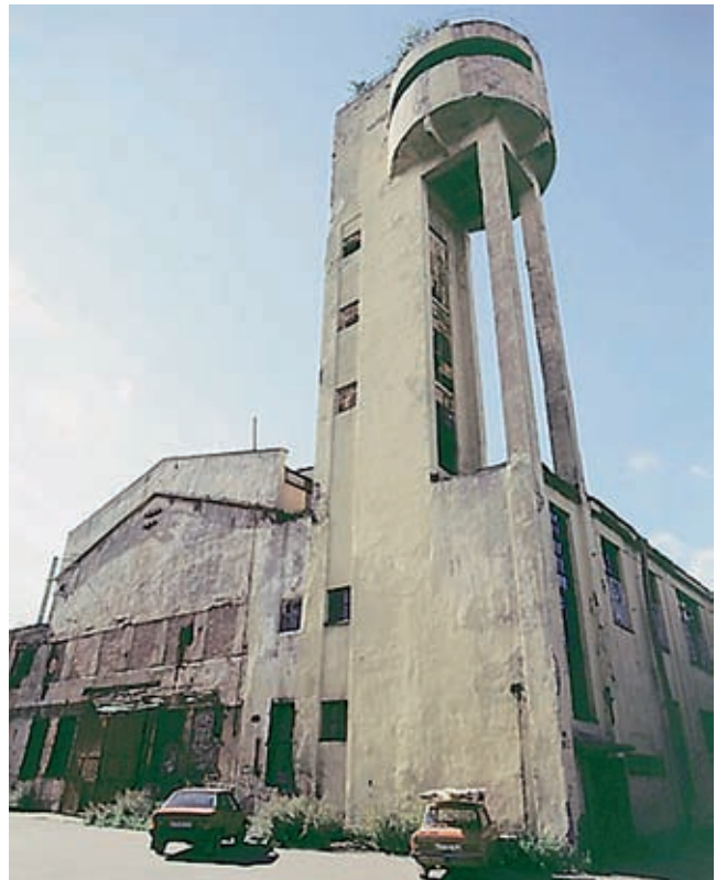
↑ Watertower of the "Krasny Gvozdilshchik" Cable Factory in St. Petersburg, 1930–1931, arch. J. Chernikhov. Condition in 2005.