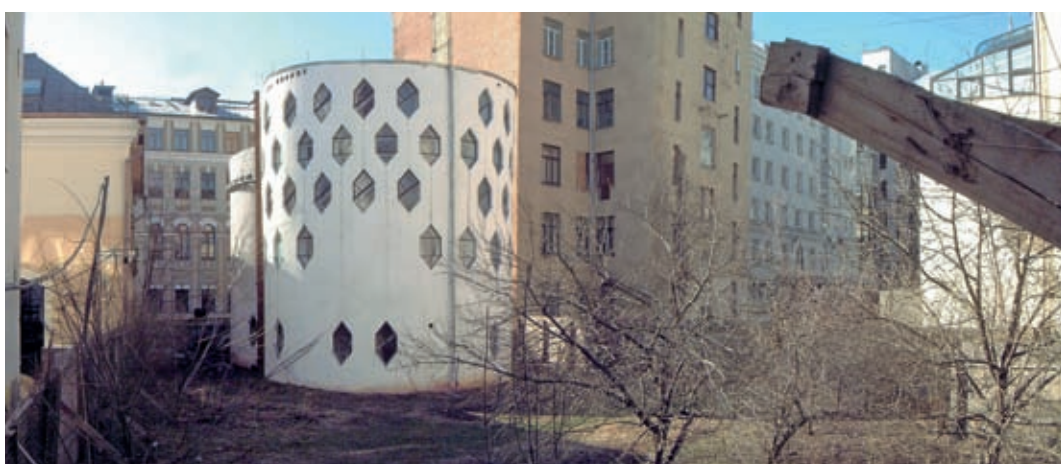
Melnikov House-Studio in Moscow, 1927–29, arch. K. Melnikov. View from Krivoarbatsky lane and from the rear side, 2005.