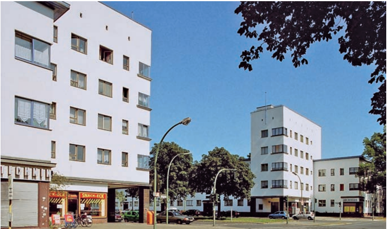
Weiße Stadt (White City), Berlin-Reinickendorf, 1929–31, arch. B. Ahrends, L. Lesser et al. Current condition.