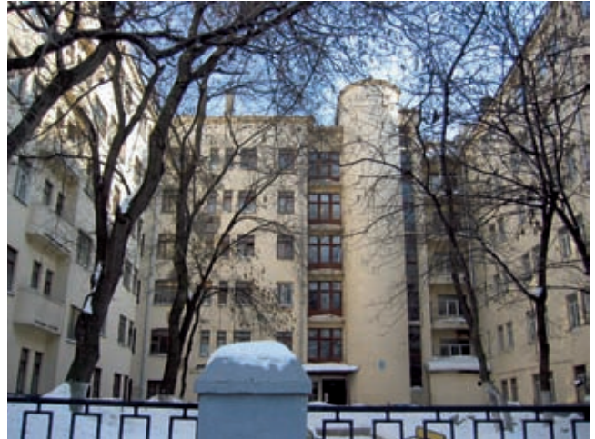
Dormitory of the former “Krasnaya Professura”-Institute on Pirogovskaya street, Moscow, 1925–28, arch. I. Osipov. It has been decided to demolish the complex. Condition in 2006.