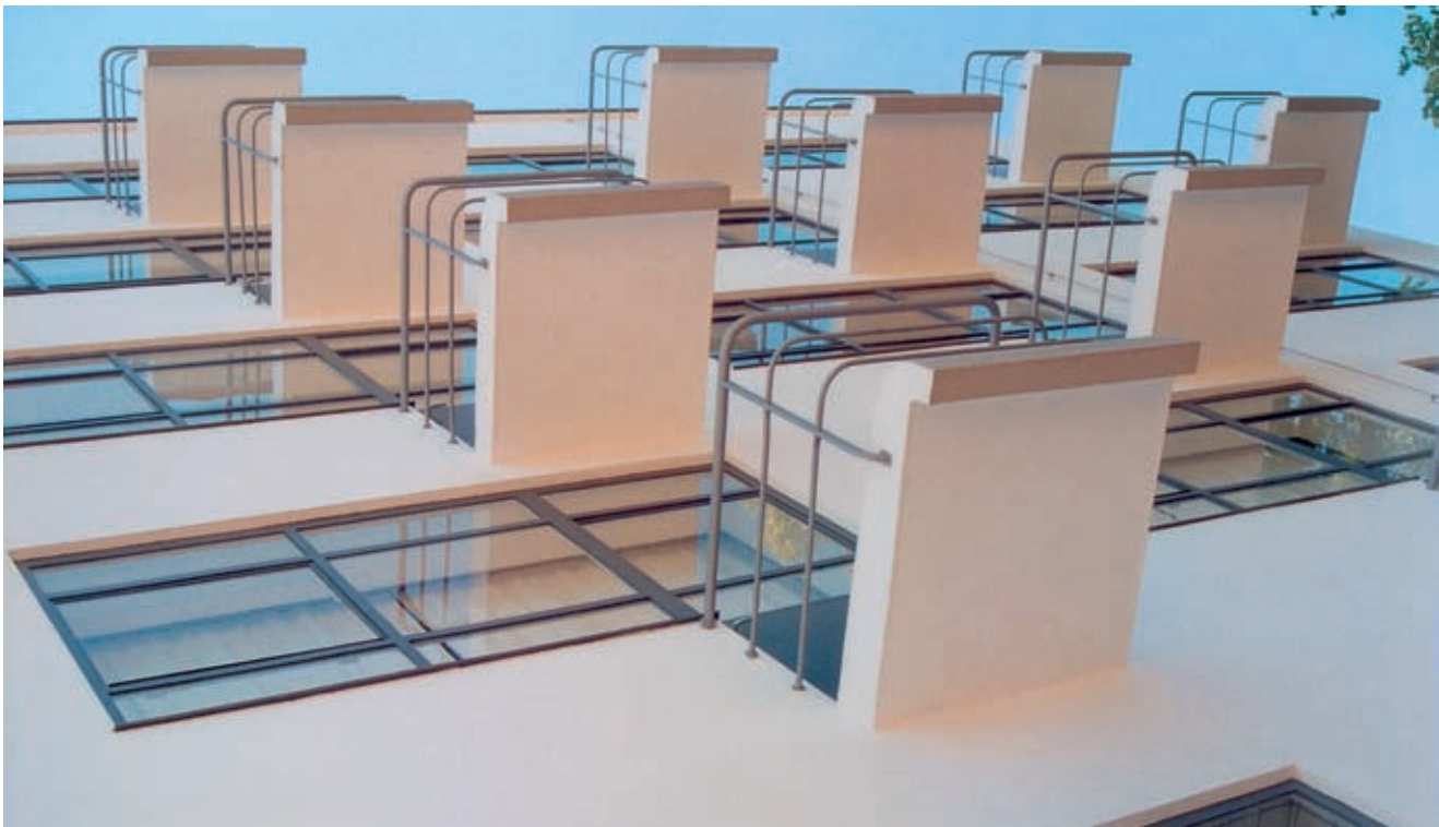
Bauhaus Building in Dessau, arch. W. Gropius, 1925. Balconies of the dormitory after the restoration. Current condition.