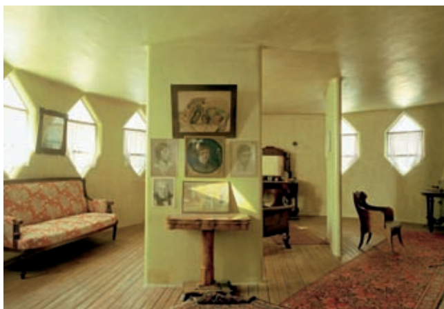
Melnikov House-Studio in Moscow, 1927–29, arch. K. Melnikov. Bedroom and Studio, 2005.