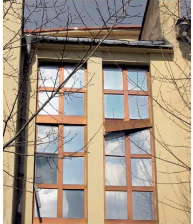
Kauchuk Workers Club, Moscow, 1927–29, arch. K. S. Melnikov. Replacement of the wooden windowframes with mirror-glazed metal-framed windows. Condition in 2006.