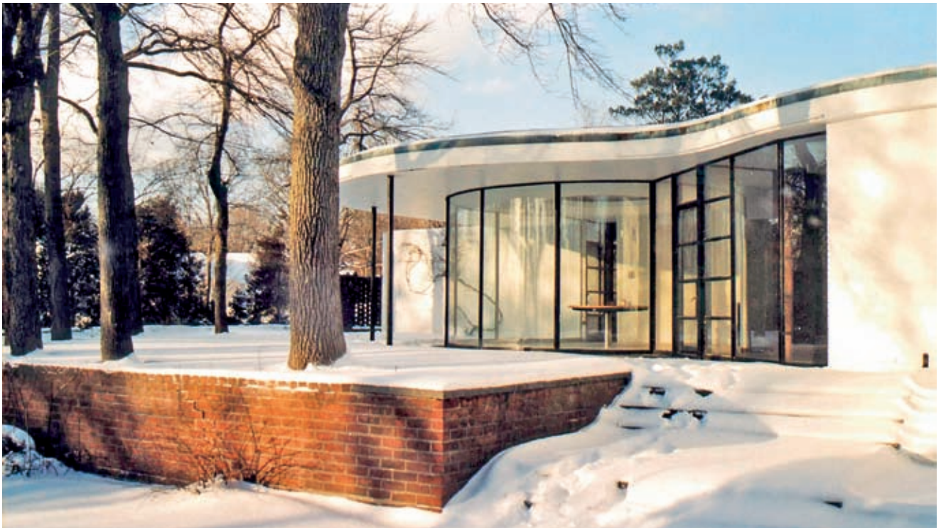
Villa Tugendhat in Brno – Czech Republic, 1928, arch. Ludwig Mies van der Rohe.