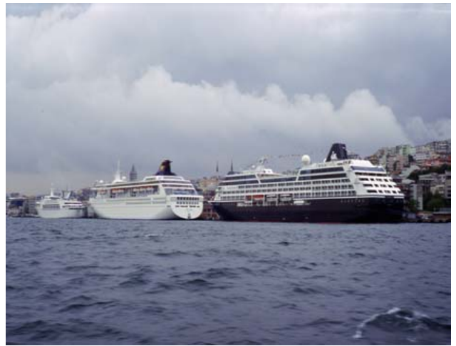
17. Cruise ships at Galata Port hiding the prospect of Tophane

16. Today there are stores and administrative buildings situated right at the shore and covering a large fenced area. There are still freighters being loaded, which however can only be observed from the terrace of Istanbul Modern Museum, located in one of the reused stores. The public Tophane place of today is very much reduced and dominated by traffic. Behind this the densely built up hill of Pera with the Cihangir Mosque right up