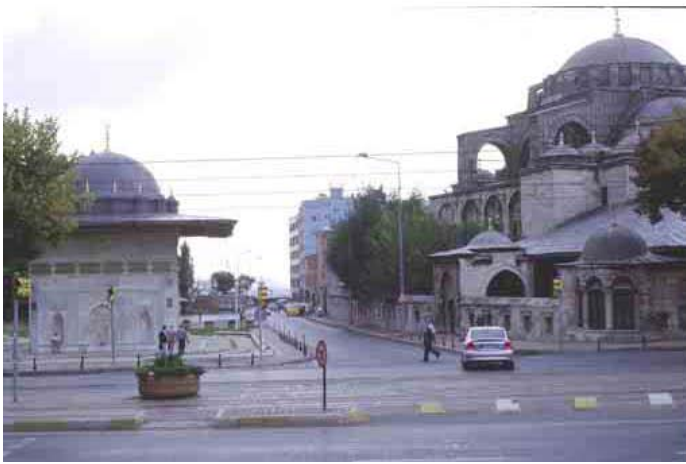
19. Tophane Fountain and Kılıç Ali Paşa Mosque, 2006