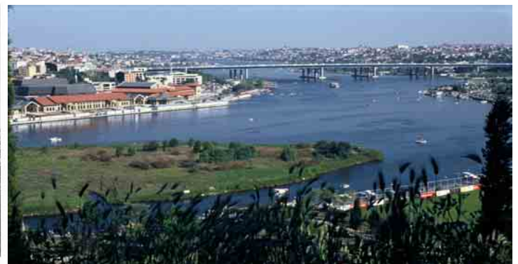
3. View from Eyüp on Istanbul World Heritage Site, 2006

4. Haydarpaşa lies in this view angle at a distance of about 10 km. It seems possible that on days of high visibility this high rise project with seven skyscrapers would appear in the background between the Galata Tower and the protected WH site silhouette. The extent of the disturbance from this viewpoint at Eyüp near the famous Pierre Loti's café will depend on the future elevation, bulk and surface material of the projected tower buildings.