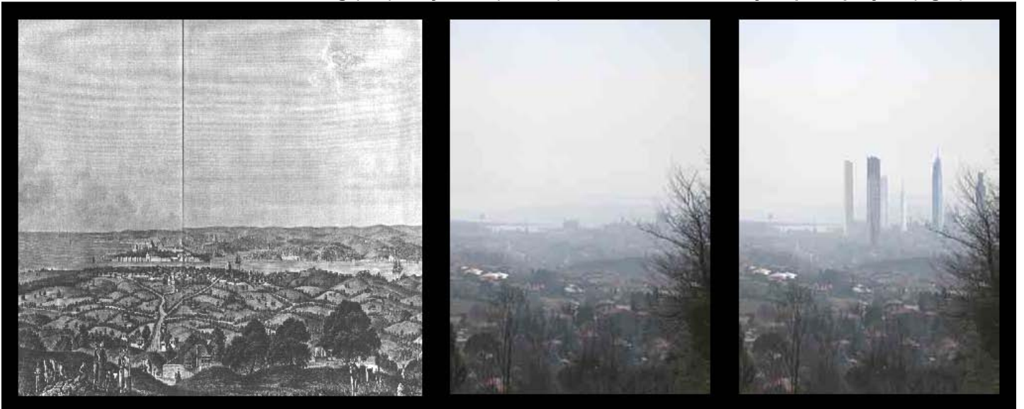
12./13./14. Views from Çamlıca: Melling (left), May 2006 (centre) and simulation of Haydarpasa project (right)

12./13./14. This view from Çamlıca , the highest swelling ground in the urban landscape (268 m), directed to the South West presents the European shore of the Bosphorus, Galata Tower and the protected silhouette of the peninsula in the background, to the right of the Golden Horn. Üsküdar is to be seen in the fore-ground as well as the rural region bordering the Marmara Sea which later became Haydarpasa. An impression of the Istanbul urban landscape with Galata and the Peninsula seen from Çamlıca on a rather misty day. Baedeker (1914) notes this view on the Bosphorus and the Marmara Sea and the entire city of Constantinople, a traditional viewpoint which is frequently visited by Istanbul's families. The Haydarpasa Towers will rise up from the plain near Marmara Sea; this area, called Calcedonia, presumably the location of the oldest settlements, might appear in later years as a Manhattan-like scenery overlapping the peninsula and the World Heritage site.