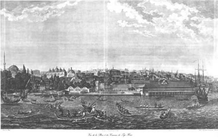
15. Tophane (Melling's Panorama 21, 1819)