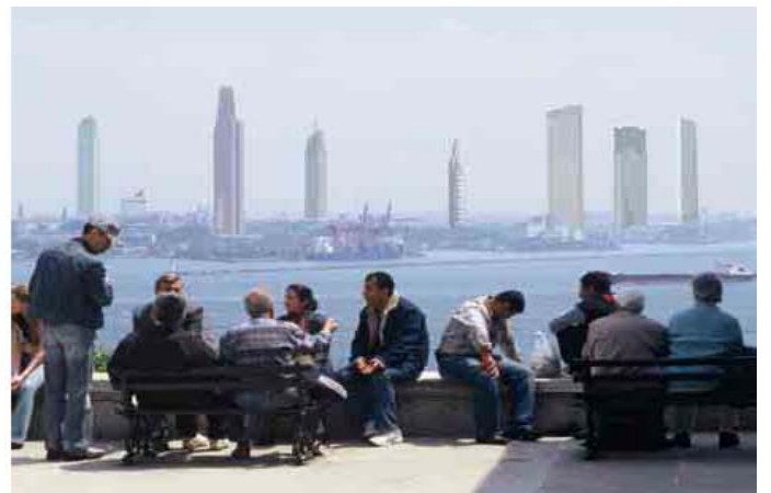
7. and 8. Haydarpaşa seen from Topkapı Terrace, 2006, Haydarpaşa Towers (Simulation)

7. A very much appreciated viewpoint is the one very near to the Topkapı Terrace.