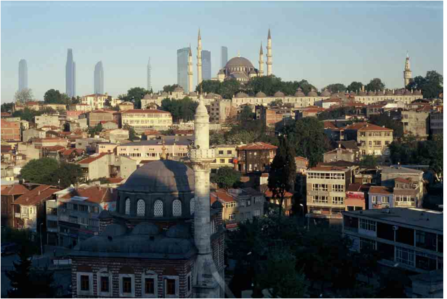
11. Haydarpasa and Süleymaniye Mosque seen from Zeyrek Terrace (Simulation)

11. The colossal Haydarpasa site would appear from Zeyrek Terrace in the range of the Süleymaniye Mosque degrading the venerable silhouette and aura of the cupola and four slim minarets. (The Haydarpasa towers are presented in a calculated scale). The Haydarpasa Project will be visible from Galata Tower as well as from Galata Bridge and might even in the view from Cihangir Mosque Garden appear as a monster project. It was Yahya Kemal who in a poem perpetuated this famous view from Cihangir to Üsküdar at sunrise.