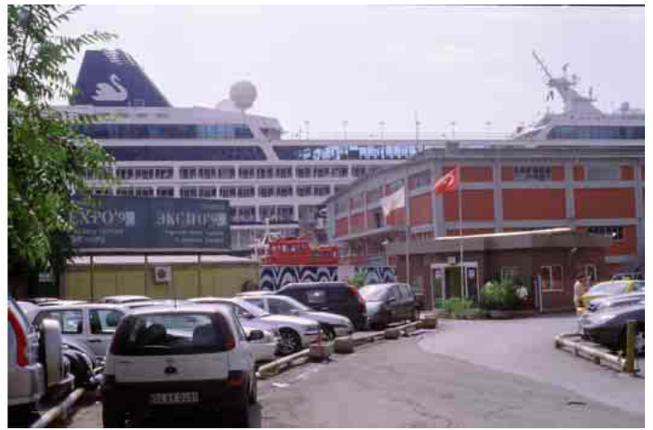
20. Cruise ship at Tophane Pier seen from Cad. Necatibey, 2006