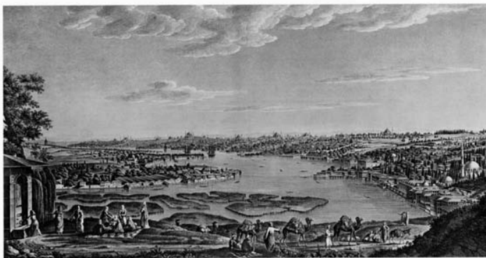
2. Constantinople seen from Eyüp (Melling's Panorama 14, 1819)