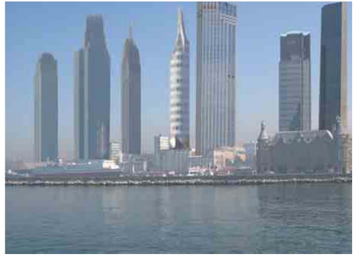
5. and 6. Haydarpaşa seen from Marmara Sea, 2006, and Haydarpaşa Towers (Simulation)

It is this shore area between the Selimiye Baracks and the Bagdad Railway Station which is supposed to become a private development project Haydarpaşa with seven high-rising towers of at least 300 m height and several less high but densely packed new buildings.