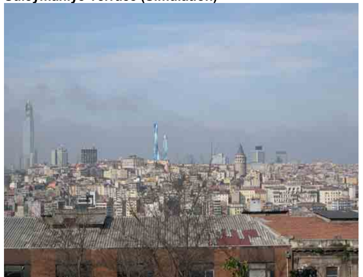
22. Dubai Towers and Bosphorus Tower seen from Süleymaniye Terrace (Simulation)

Considering the expected mass tourism – up to 15 000 day-tourists could arrive here more or less at the same time – this would cause a tremendous pressure on the city neighbourhood, especially with regard to public space and places. This dense, various and ambiguous urban structure with narrow stairs, crooked and steep streets are substantial remainders of the old and famous Galata harbour and Pera quarter .