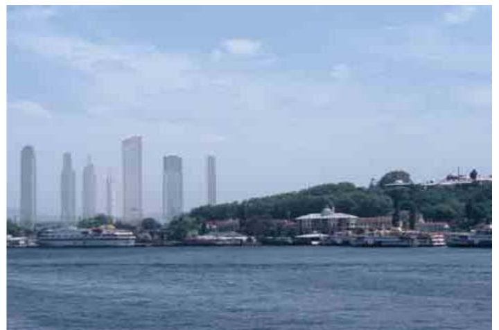
9. and 10. Cape of the peninsula with Topkapı (Simulation)

9. A recent view on the cape of the peninsula with Topkapı taken in the evening from the boat coming from Princess Islands.