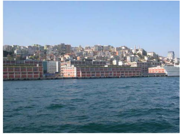
16. Tophane Pier with Cihangir Mosque, 2006