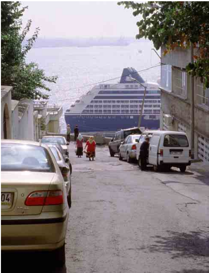
21. Cruise ship seen from Cihangir Slope near the Mosque, 2006

22. The Dubai Towers and Bosphorus Tower will appear in the view angle out of the WH Site from the terrace of Süleymaniye Mosque (which is about 50m high and 10km away) in the background of Galata, Beyoğlu, Sisli in a truly colossal dimension. They might extremely rise above the height of the Galata Tower and the context of several high-rising modern buildings. The Dubai Towers und Bosphorus Tower as viewed from the WH Site will definitely degrade and compromise the Byzantine Galata Tower of the Genuese port (the hill has an elevation of 45m, the gallery of the tower of 44.5m)