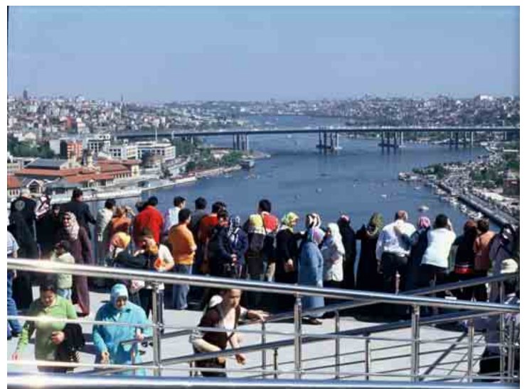
4. Viewpoint at Eyüp, 2006

4. Haydarpaşa lies in this view angle at a distance of about 10 km. It seems possible that on days of high visibility this high rise project with seven skyscrapers would appear in the background between the Galata Tower and the protected WH site silhouette. The extent of the disturbance from this viewpoint at Eyüp near the famous Pierre Loti's café will depend on the future elevation, bulk and surface material of the projected tower buildings.