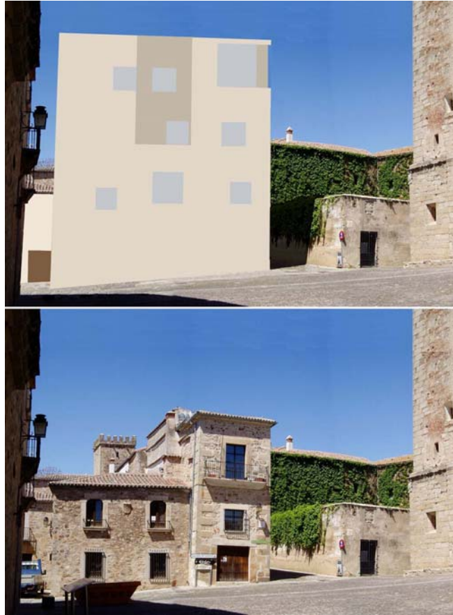
Photomontages of proposed project by ADENEX. (El Periódico Extremadura, 09/05/2005).