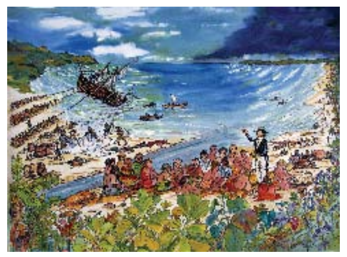
Figure 4: This historical reconstruction depicts the native Hawaiian attempt to salvage the shipwreck in May 1824; in the foreground, Boston missionary Hiram Bingham preaches a sermon to the native inhabitants on the evils of drink, which was a factor in the ship's loss