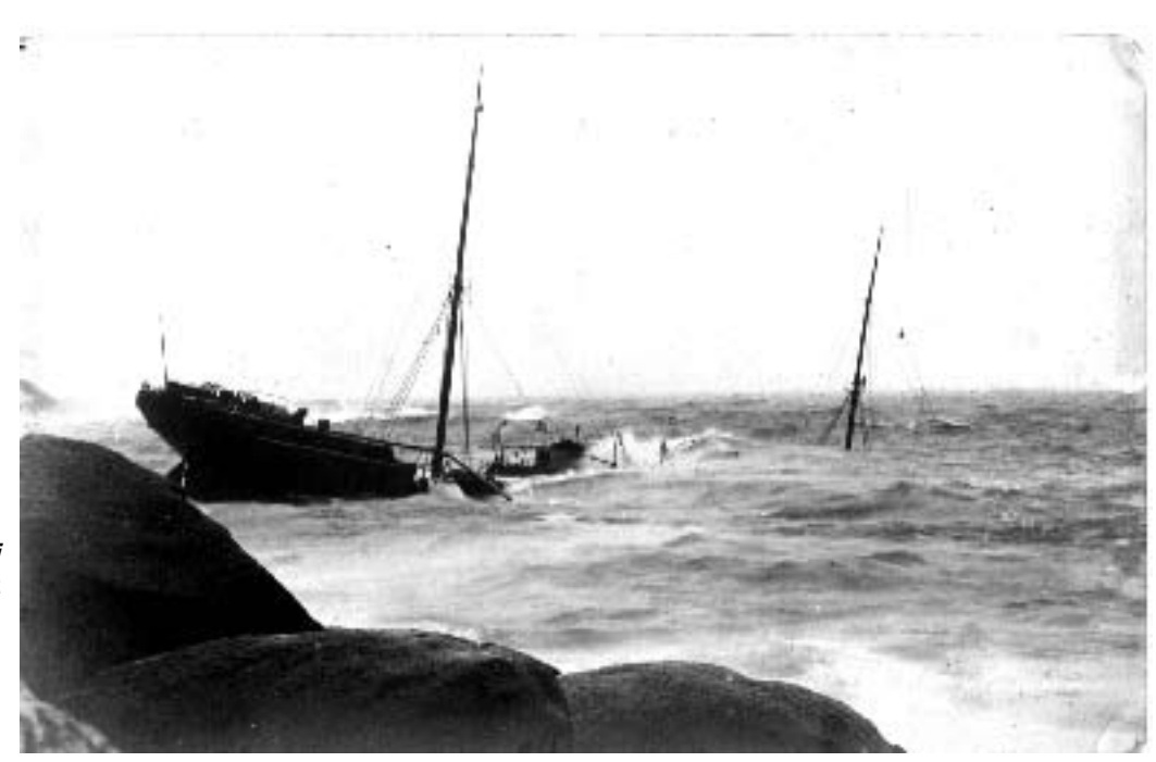
Figure 1 : A historical photo of the wreck of the Maori taken before the crew left aboard had been rescued. Note the figure on the foremast

Today the Maori is one of the most popular recreational dive sites on the Cape Peninsula. Its location on the western, Atlantic seaboard of the Cape Peninsula means that during the South African summer months diving conditions on the site are often optimal, with very cold, but very clean water. The sheltered nature of the bay in which the wreck lies means