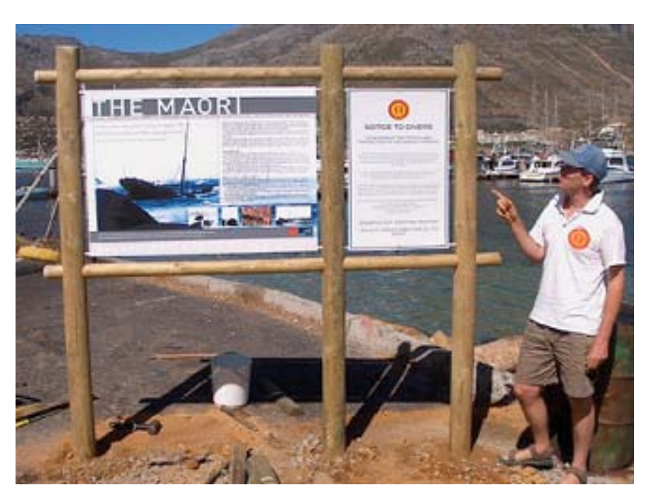
Figure 2: Cape Peninsula Wreck Route sign for the Maori

While this approach to managing threatened underwater sites is in some senses post hoc, if it proves successful in managing risk on a heavily utilised site such as the Maori, SAHRA envisages its useful extension to other threatened, or potentially threatened sites, in the future. It is hoped that an increased awareness amongst visitors of the archaeological potential of a well preserved wreck like the Maori, will ensure the long term survival of the site.