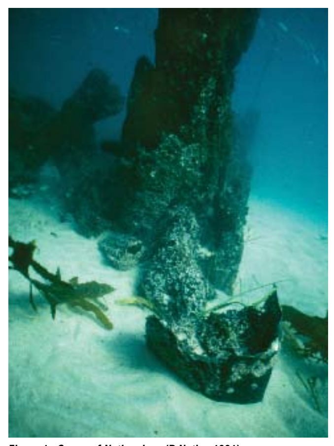
Figure 1: Queen of Nations bow

One of the major changes between the exposure in 1976 and 1991 had been the establishment of an Underwater Cultural Heritage Program in the Department of Planning's Heritage Branch. (The Heritage became a separate agency, the New South Wales Heritage Office, in 1996.) When the remains were discovered by divers from the Public Works Department, staff in the Heritage Branch were notified and