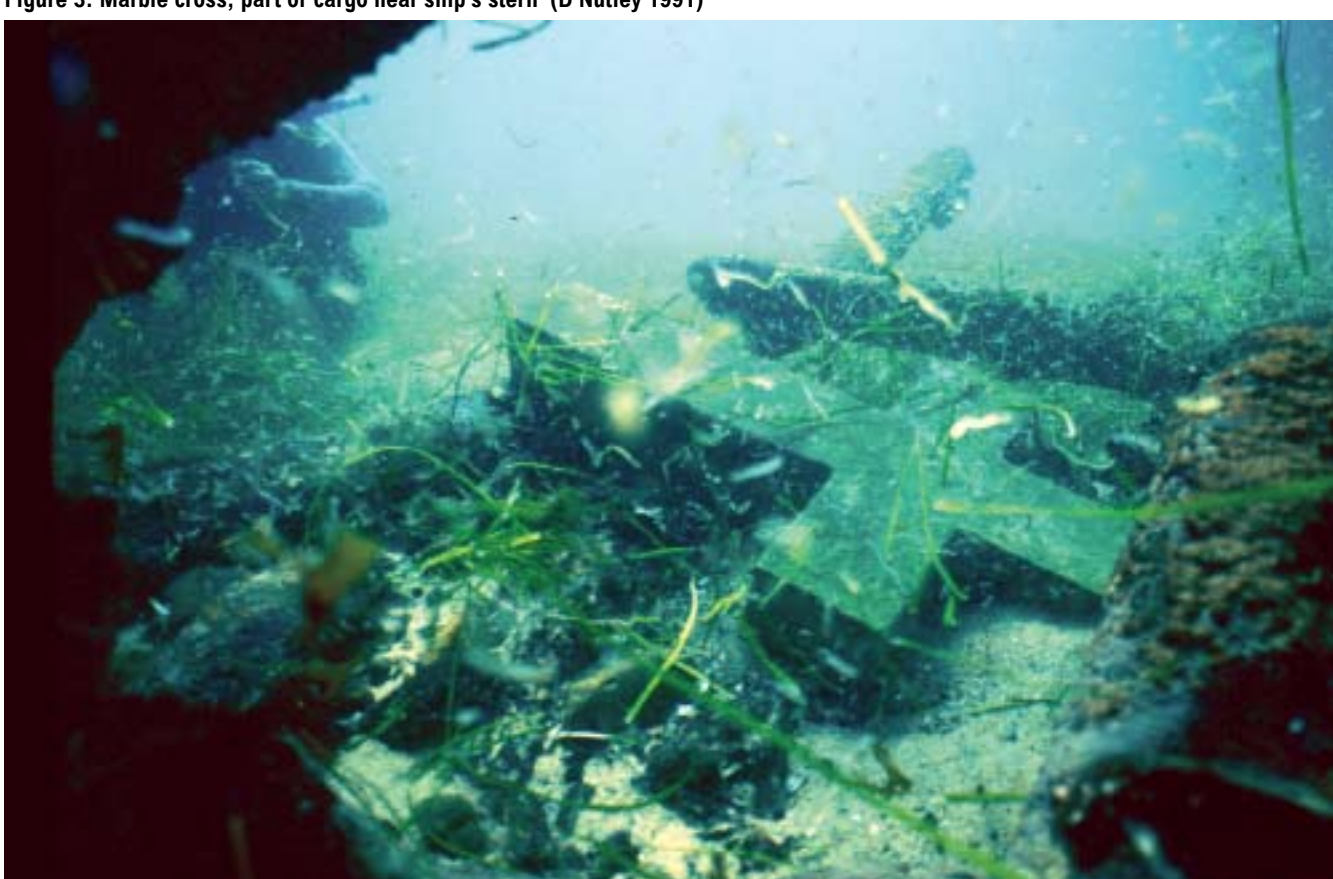
Figure 3: Marble cross, part of cargo near ship's stern (D Nutley 1991)

On the positive side, the tragic experience of the Queen of Nations played an important roll in the protection of Australia's underwater cultural heritage. It also, in part, contributed to Australia's strong stand on this issue during the formulation of the UNESCO Convention for the protection of the underwater cultural heritage. It is perhaps one of the most important components of that Convention.