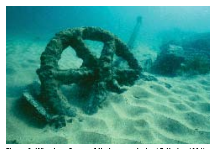
Figure 2: Wheel on Queen of Nations wreck site ( D Nutley 1991)

an inspection and survey was commenced within a couple of days and completed a week later.