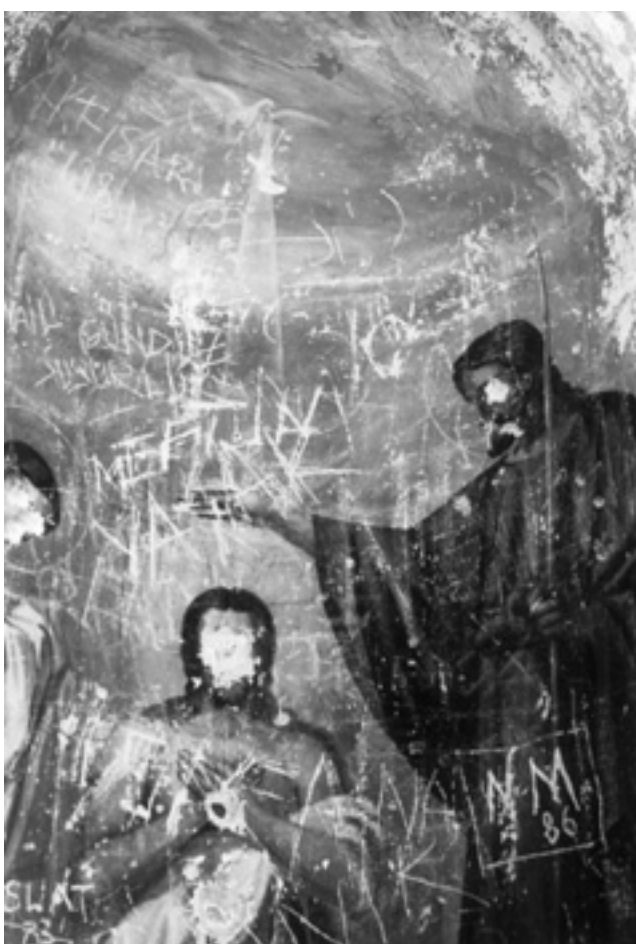
Cunda Adası, domed church, vandalised niche painting 'Baptism of Christ'