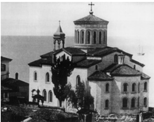
Trebizond, church 'Hagios Gregorios of Nyssa (1863), blown up in the 1930s

The problems in protecting and caring for heritage places are many and widespread. Many churches do not possess an attractive outer or inner appearance, or no longer do, because at times the building materials used were quite plain. This also leads to an inappropriate management assessment and evaluation, because a building might be ranked as not aesthetic enough to be protected at all. It is precisely this that has caused and is causing the loss of many heritage buildings in many rural areas, as well as the strong interest to readily getting cheap building materials for modern structures.