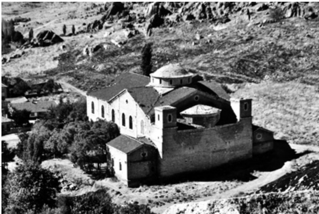
Sivrihissar, large Armenian domed basilica built in 1881 (2003)

(Greek: Kydonia) on the West coast. The triconch cross-domed church of this village is in definite danger of collapsing. Cracks in the building's brickwork are undeniably threatening the pillars and the vaults, and this might lead to a total collapse of the building in the near future. As well as this, we still find remains of the church furnishing, such as the iconostases, which often were constructed of wood, and bishop's thrones and chancels, in a ruined state, for example inside the church of Hagios Archangelos Michael in Sille near Konya in Phrygo-Lycaonia. In addition, stucco decorations