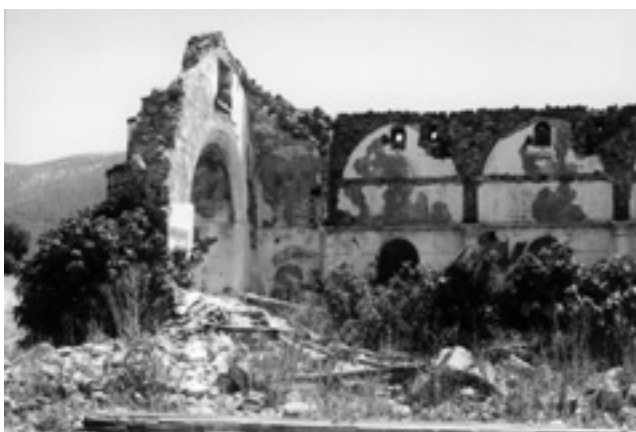
Yayla Köyü, area of Muğla (Caria), village church (19th c.): View from the north