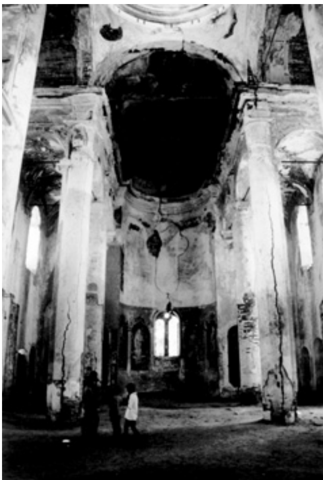
Cunda Adası, near Ayvalık, domed church, cracked brick-pillars and vaults