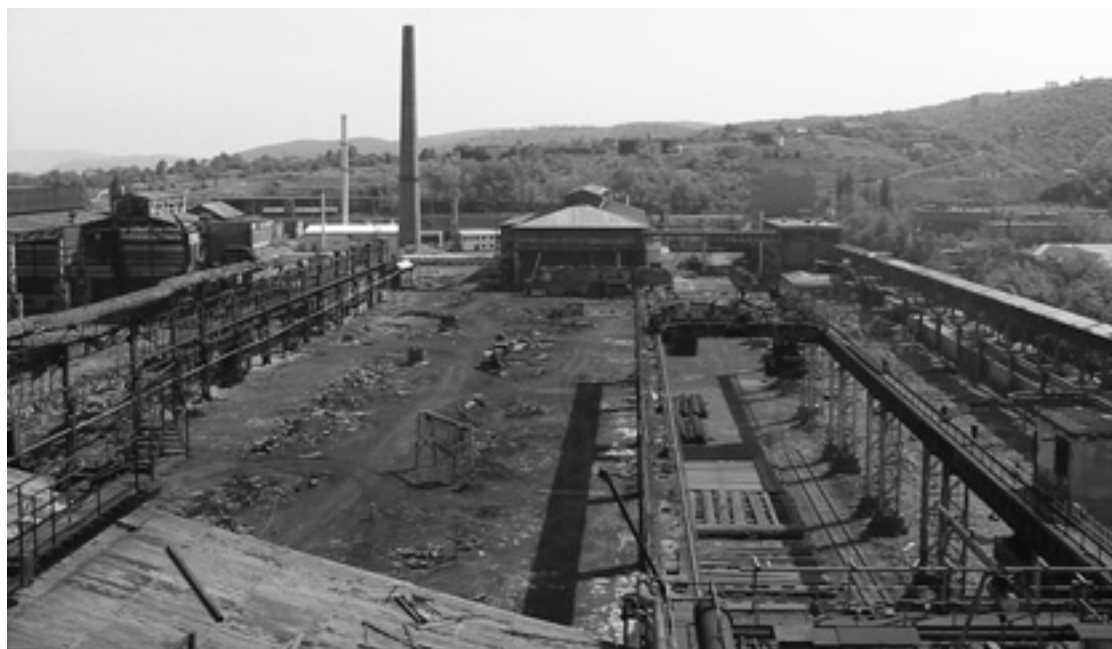
Ózd, the factory today