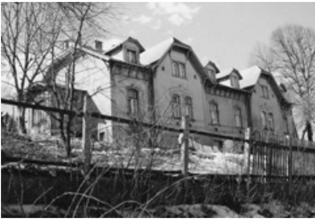
Ózd, the Big America Colony