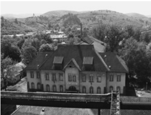
Ózd, the Reader's Club