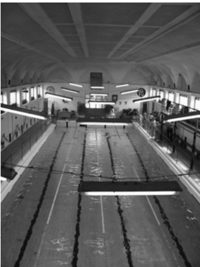
Ózd, the swimming pool

Hungary traditionally with a church and a main square) but a factory itself.