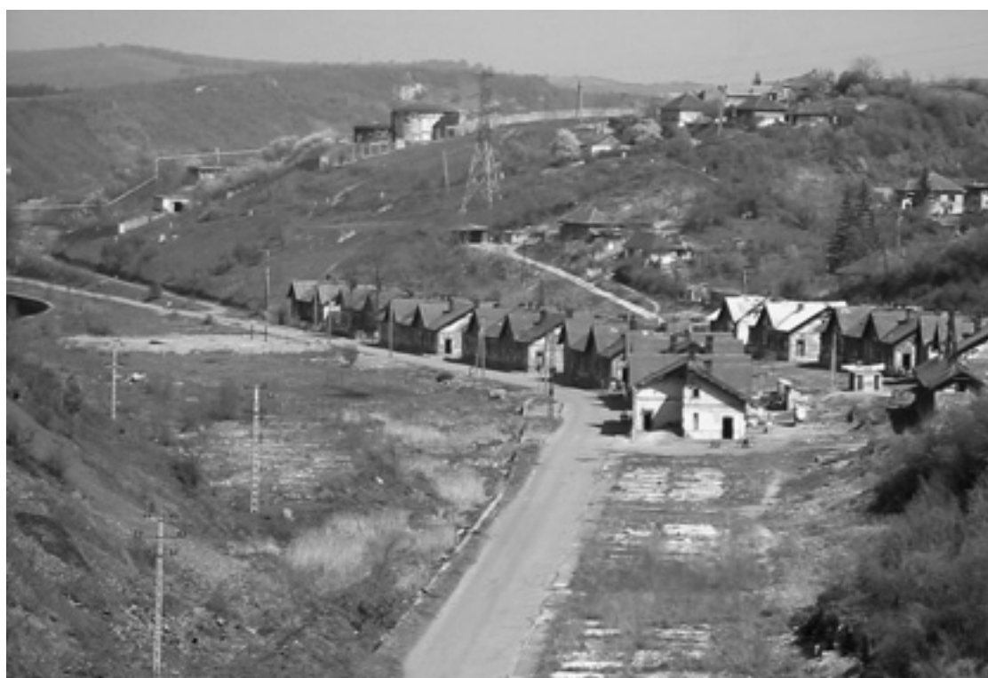
Ózd, one of the poorest colonies today