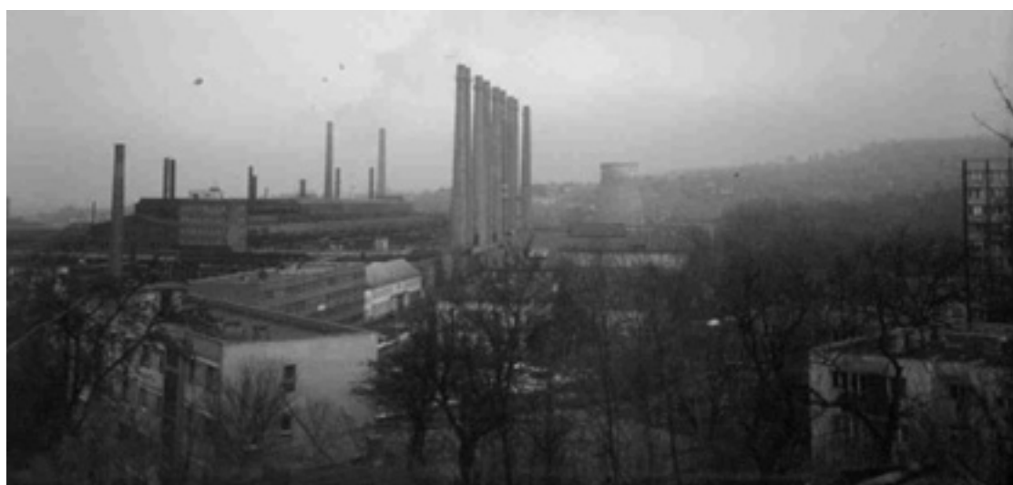
Ózd, the former 'Chimney Cathedral'