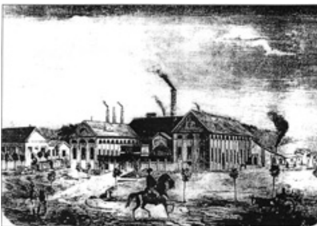
Ózd in 1864

Our aims are to open the factory to the town and that the empty space also provides opportunity to cultural and business re-use. Instead of the demolished chimney-stacks we plan chimneys of