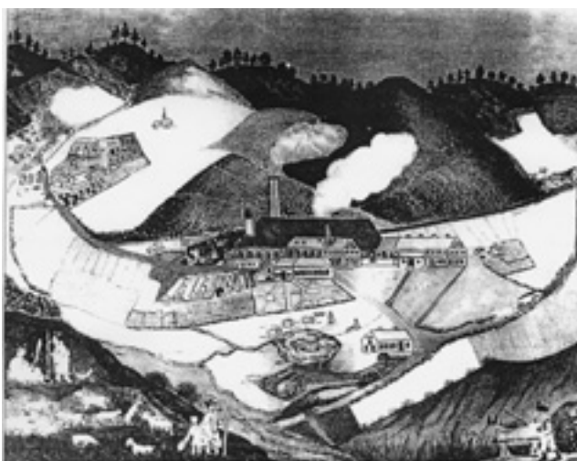
View of Ózd in 1847

laser light as the symbol of Ózd's revitalisation. The site of the factory swimming pool must also be opened.