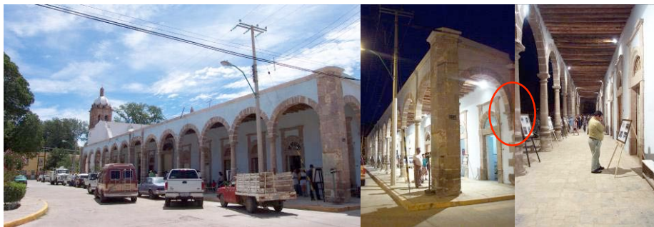
Figure 6. Left: North (main) front of Consistorial house; right: location of hand marked in red

However, this element that very well can be related with a whole system developed during the mentioned Golden Century, is not found in any other place in the State of Chihuahua, Mexico, or even Spain, according to the conversations held with Dr. Gomez Piñol (2001). It is a completely local representation that gives another dimension to the place's spirit, but it bonds it to a macrovision at the moment of its creation.