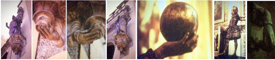
Figure 4. Hands in the Cathedral of Sevilla.