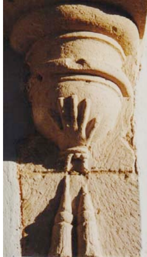
Figure 2. Hand on bracket in Consistorial House

meditation, and in there, a mute language in concordance with the diverse divisions framed in them, is generally enclosed (RODRIGUEZ, 1995)