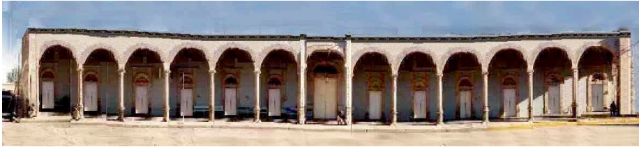
Figure 5. North (main) front of Consistorial House.