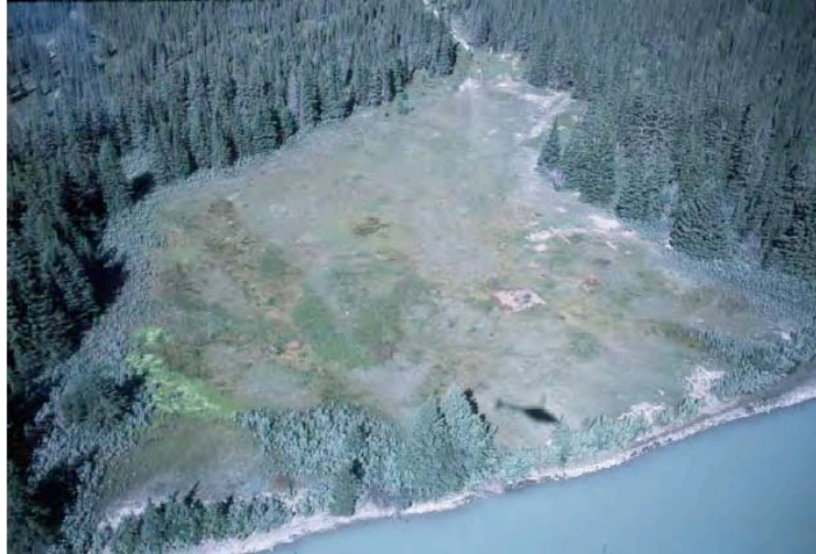
Figure 1. The designated place of Jasper House National Historic Site of Canada is defined by the edges of the forest clearing. The trail leading westward into the mountains is visible at the top of the photo (Photo: Parks Canada, 2005.)

For visitors, the site is not easily accessible. Although located only a few kilometres from the town of Jasper, the major community in the national park, the site is not on a main road. The Canadian National Railway line is located west of the site but no public hiking trails or roads are connected with the rail corridor. Because of its isolation, there is no extensive interpretation on the site. The official Historic Sites and Monuments Board of Canada plaque is across the river at a pull-off on the main road through the national park.