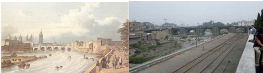
Figures 4 and 5 The Bridge in Lima in the 19 th Century (left) and today (right)

Compared to the preceding examples, which all refer to bridges integrated into their -mainly conserved- natural landscapes, urban bridges are much more subject to alteration, destruction and changes of their environment. One of the most striking examples for the deterioration of an urban bridge is the case of the “Stone Bridge” in Lima (Peru) (Bühler 2007, 1) ( Figurs 4-5 ).