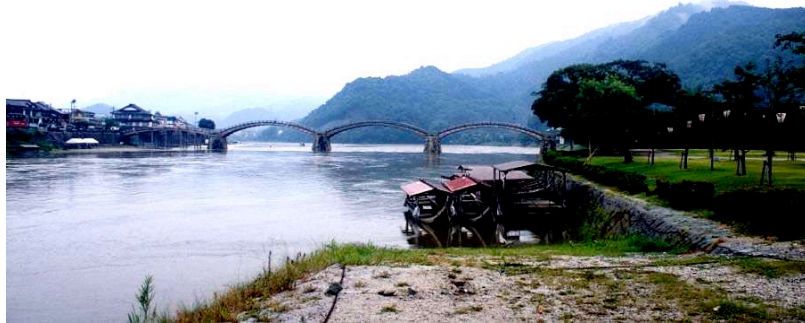
Figure 3 The Kintai-Kyo-Bridge

The wooden Kintai-Kyo-Bridge in Iwakuni ( Figure 3 ) is another outstanding and suggestive example for the study of the spirit of a place and furthermore for the obligation to conserve an intangible