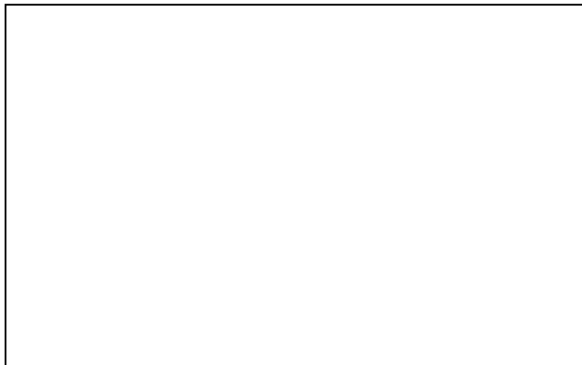
Old Faithfullnn. Yellowstone National Park