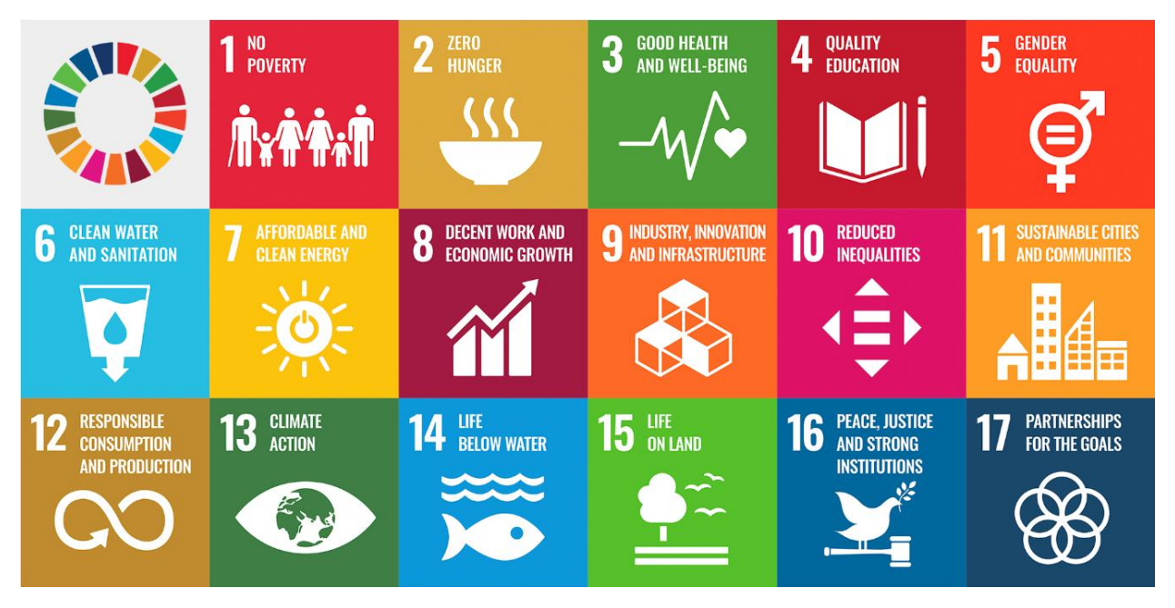
Figure 1. The United Nations 17 Sustainable Development Goals

A desk review was carried out by both the SDGWG and GHF, relying primarily on existing expertise and experience found within each organization. Sixteen (16) published research articles and governmental papers were identified and a selection was reviewed to identify the SDGs addressed in each document (see Appendix 2). The consultation with the SDGWG Task Team 6 provided some guidance about the possible documents and sources to be used as reference. The papers reviewed came from a broad geographical context and covered a variety of built cultural heritage and more expansive cultural heritage projects. Along with academic publications, several key government papers were reviewed as well.