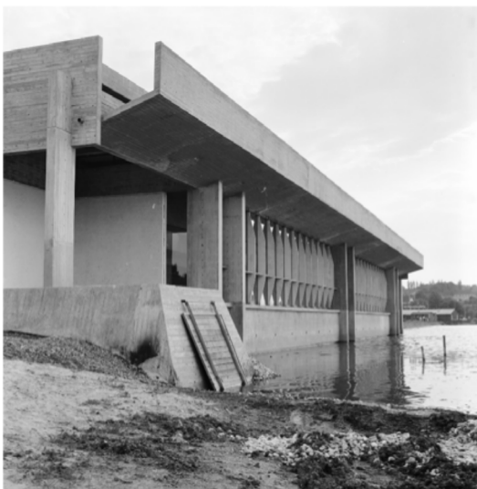
The north facade ca. 1970.

ISC20C appeals for immediate action to preserve the Viking Ship Hall as an internationally outstanding architectural ensemble that has significant future large socio-economic potential.