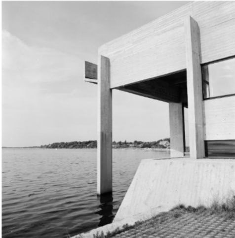
North west corner.