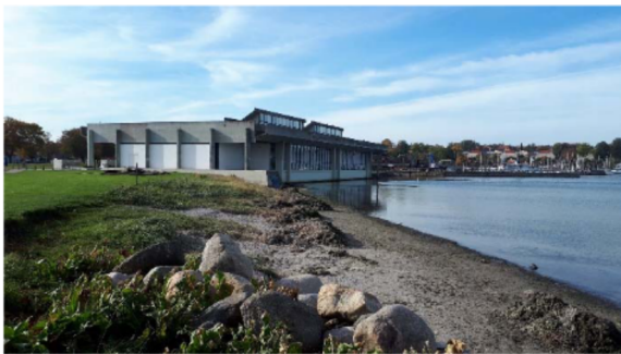
The Viking Ship Museum 2018.