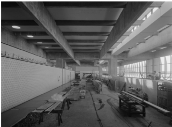
The Viking Ship Hall ca. 1970, before the ships were in place and the hall was still functioning as a workspace as well as an exhibition hall.