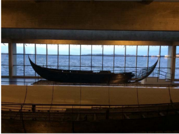
The Viking Ship Museum 2018. Interior.