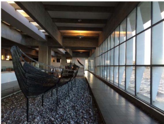
The Viking Ship Museum 2018. Interior.