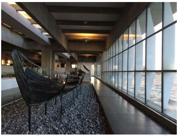
The Viking Ship Museum, 2018. interior photo: Elise Stoklund