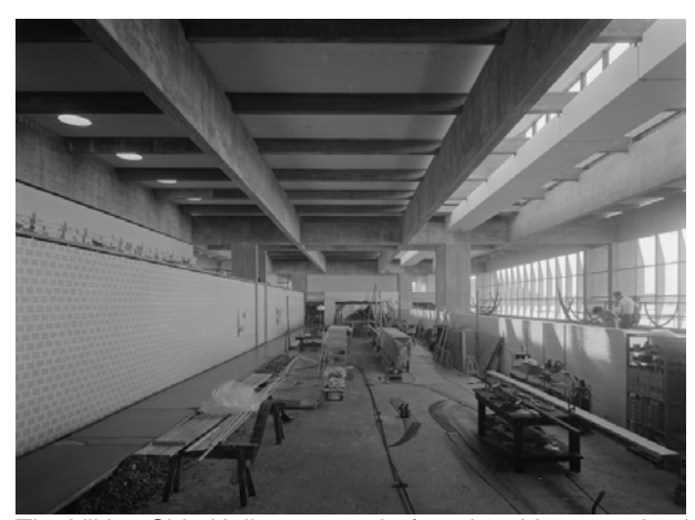
The Viking Ship Hall ca. 1970, before the ships were in place and the hall was still functioning as a workspace as well as an exhibition hall.