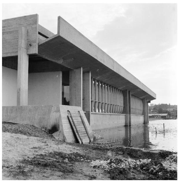
The north facade ca. 1970, photo: Keld Helmer-Petersen ©

ISC20C appeals for immediate action to preserve the Viking Ship Hall as an internationally outstanding architectural ensemble that has significant future large socio-economic potential.