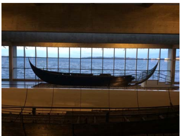
The Viking Ship Museum 2018.