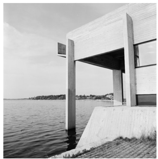
The north west corner, photo: Keld Helmer-Petersen ©