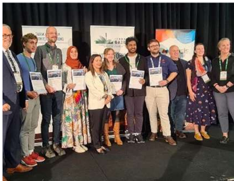
Photos of participants at the Youth Forum on Cockatoo Island, 2023.

In conjunction with the GA 2023, which was held in Sydney in September, a three-day youth forum was organized on Cockatoo Island, one of the old World Heritage convict site. From Friday 1 to Sunday 3 September 2023, an enriching cultural camp on the theme of "heritage changes" lit up Cockatoo Island thanks to the support of the Sydney harbor federation trust.