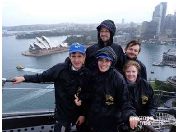
Tour of the Sydney Harbor Bridge, 2023

The Stain theme linked to the themes “Resilience, Rights, Heritage and Sustainability” of GA 2023, addressed the issue of “How are places marked by the past and shaped by contemporary heritage practices?” where young heritage practitioners explored how to recognise traces of the past in contemporary practices and approaches, issues relating to indigenous and first nations heritage, colonialism and multicultural heritage. They have also learned to consider minority communities and the need to recognise the difficult histories and contested places that make up the different layers of heritage.