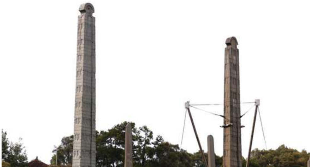
Giant stelae at Axum © Mikiyas Tewodros. 2023

Axum was an ancient civilization that flourished between the 1st and 6th centuries AD in Africa. The Axum Empire, located in what is now modern-day Ethiopia and Eritrea, was an important trading and naval power in the region. The significance of this civilization goes beyond its economic prowess to include its cultural and religious contributions.