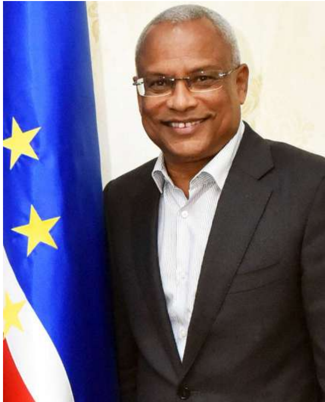
H.E. JOSE MARIA NEVES PRESIDENT OF CAPE VERDE