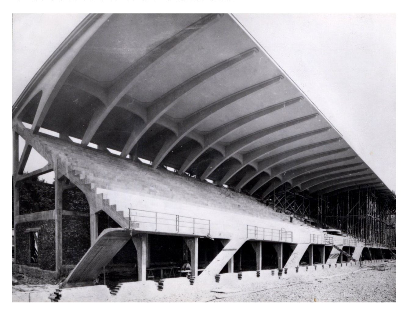
The grandstand under construction, 1930

The stadium is of reinforced in situ concrete construction throughout, using moment connections for lateral stability and heavy steel reinforcing to achieve the relatively light forms of the cantilevered roof and helical staircases.