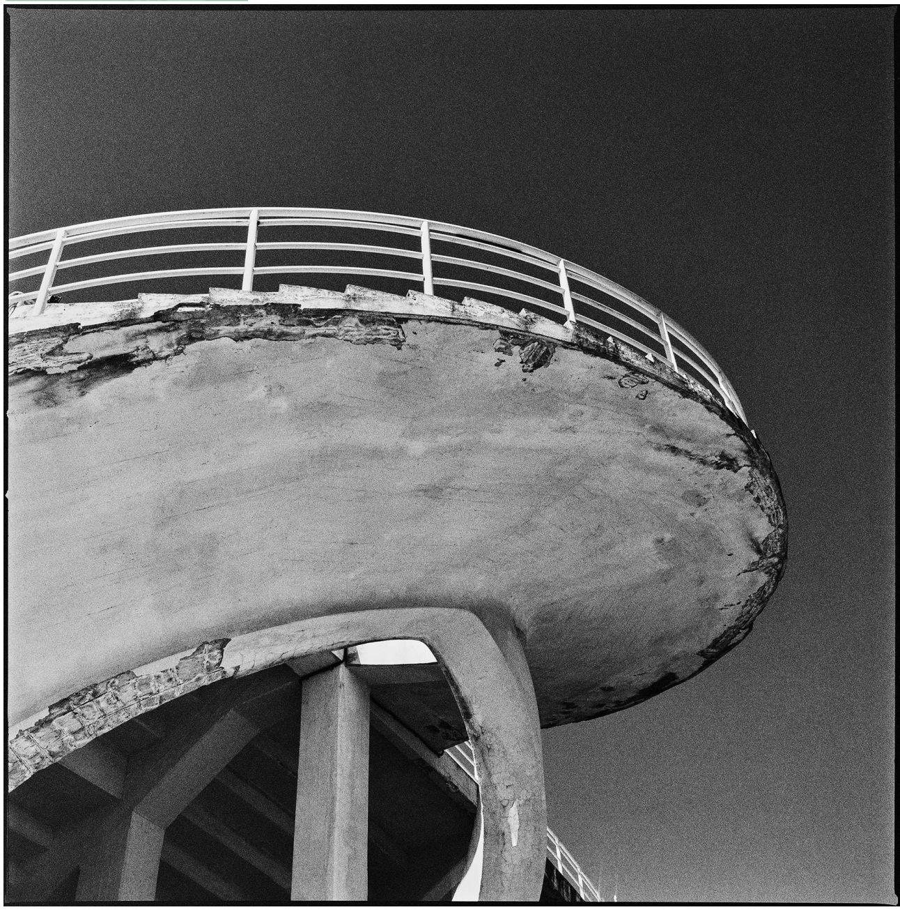
Detail of one of the helical staircases, @Marco Menghi, 2018