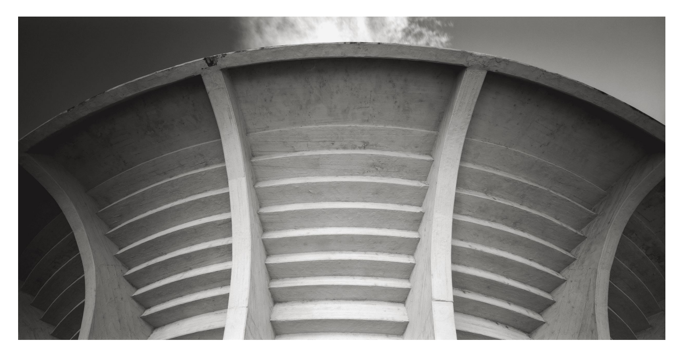
Exterior of one of the curva structures, ©Matteo Cirenei, 2018

These graceful moments are matched, however, by a thorough approach to structural form and detailing throughout the grandstands, where frames and moment connections are shaped to reveal and to model ideal static forms throughout. While less celebrated, these details and elements deserve preservation as evidence of Nervi's encyclopedic knowledge of static form and constructive grammar; collectively they form a rhythmic backdrop for the more dramatic moments of the roof, stairs, and tower.