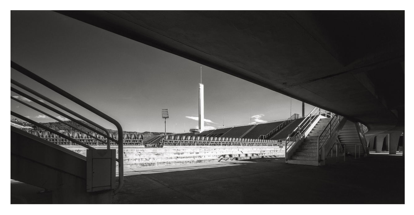
View of the Torre di Maratona from inside the Stadium, ©Matteo Cirenei, 2018

However, the recent "stadium unblocking" legislation passed by the Italian parliament earlier this year (Article 55-bis of Law Decree no. 76 of September 4, 2020) specifically exempts sporting facilities from the strict requirements of the Cultural Heritage Code and gives wide latitude to the Ministry of Cultural Heritage and Activities ("MiBACT") to determine what constitutes "historical value" and provides far more relaxed standards—including the preservation of small fragments of the original, or even reproductions—for meeting any remaining requirements. This legislation threatens all sports facilities of historic value in Italy but appears to have been passed in concert with the city's efforts to facilitate a new stadium on the Stadio Franchi site.