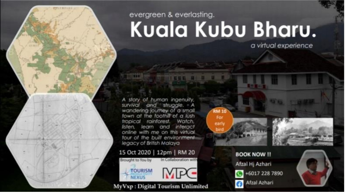
Kuala Kubu Bharu – 1<sup>st</sup> Garden City Planned in Malayan's in 1920s by Charles C Reade during his appointment as 1<sup>st</sup> Town Planner in Malaysia.