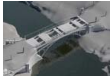
Figure 9: untextured 3D model

nature of the data capture (including the highly ornate but damaged columns) and ease of capturing incidental contextual data such as the entire building facade, most of the streetscape and street furniture and adjacent vegetation.