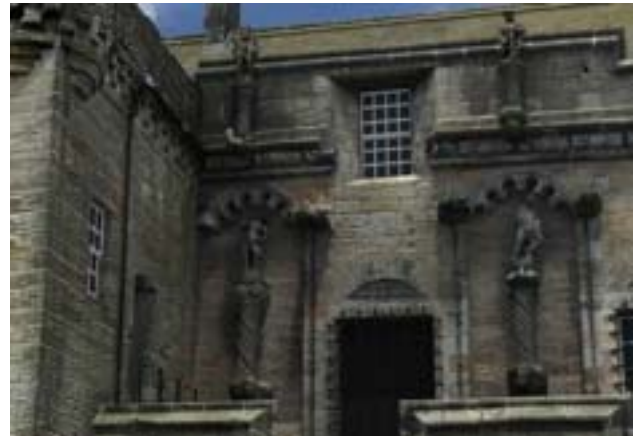
Figure 15: 3D representation of the South facade