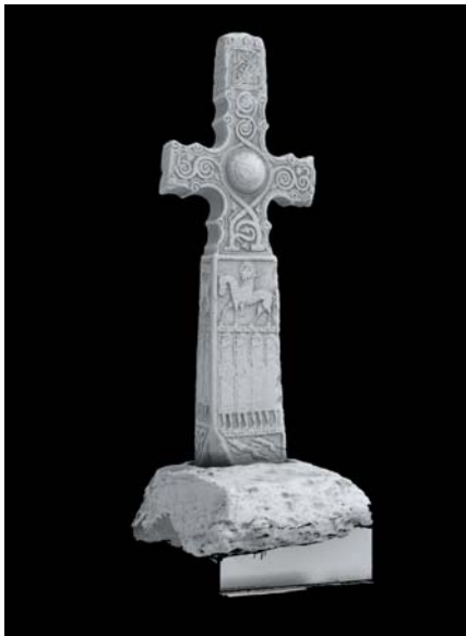
Figure 13: Dupplin Cross 3D mesh model

An Ogham inscription on the Dupplin Cross dating from 800AD has been scanned on site within St. Serfs Church at 0.5 mm and is currently being prepared for analysis. Scanning and enhancement techniques will allow this inscription to be studied in great detail than was previously feasible.