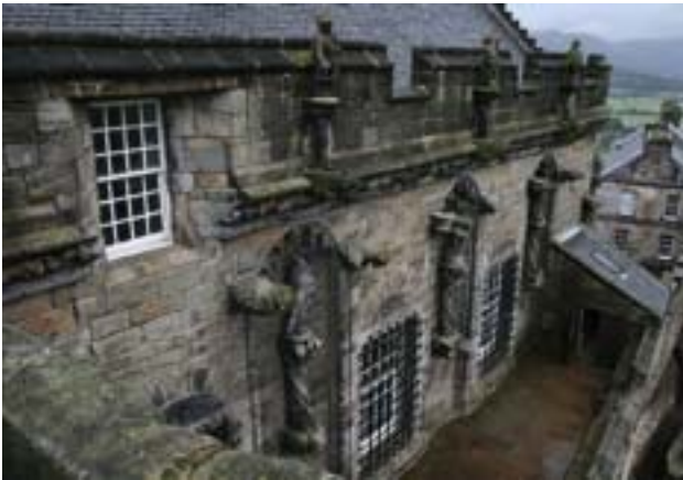
Figure 14: South facade of the Stirling Castle Palace