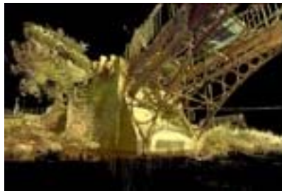
Figure 8: 3D point cloud