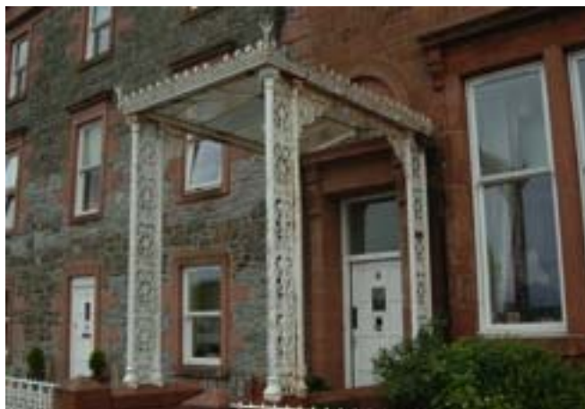
Figure 5: Metal canopy - pre-restoration