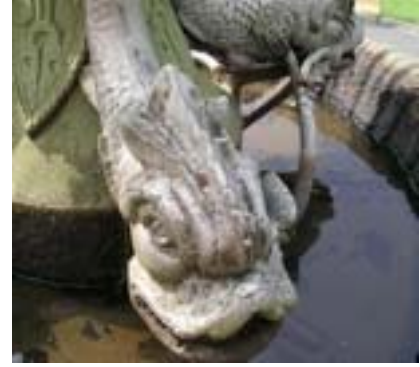
Figure 12: Sculpture at fountain mid-level