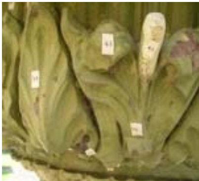
Figure 10: Paint and surface analysis

To date both the interior and exterior have been comprehensively scanned over a two day period using 2 scan systems. Particular attention was paid to thoroughly document the eclectic assembly of machine parts and hand tools. The point-cloud will provide an invaluable locational record of the artefacts and architecture once this building is reassembled.