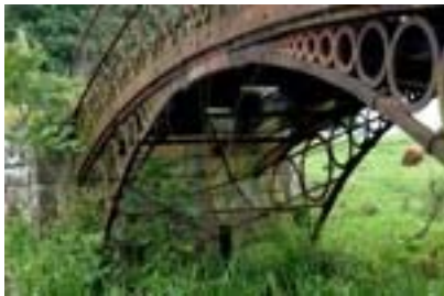
Figure 7: Existing bridge

In comparison to the traditional survey (with a total station or theodolite), the speed of documentation was immediately evident as was the dimensional accuracy. Other benefits included the comprehensive